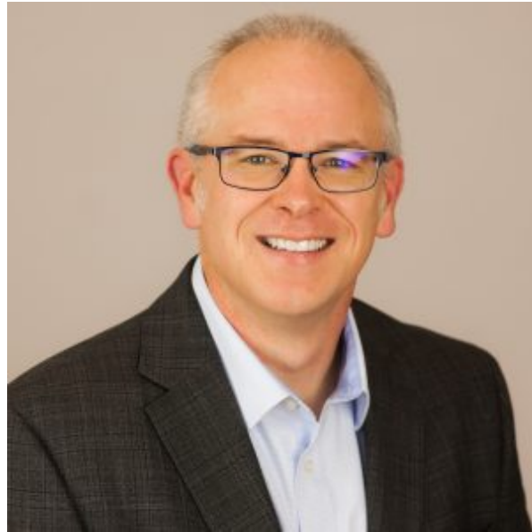
Figure 2: David Wiley

landscape, describe why generative AI is now a more effective tool for accomplishing these goals than OER is. The similarities between the early criticisms of OER and the current criticisms of generative AI will be discussed. Finally, the talk will close with a look ahead to some of the ways generative AI will allow our pedagogies to expand and improve in the future.